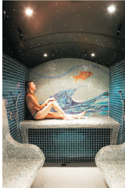
The Views Boutique Hotel and Spa is a contemporary styled hotel set on the Wilderness dunes

This is unusual for a relatively small and complex building like the Views Hotel; normally the system is only used for large structures like parking garages and office blocks. This technology also made the long and unsupported span of the bridge feasible.